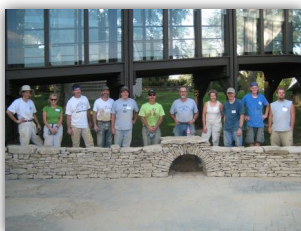
Yew Dell Gardens

The Conservancy held General Public Workshops in Mercer County, KY at Shaker Village of Pleasant Hill, Nelson County, KY at the historic Maker's Mark distillery in Loretto, and in Oldham County, KY at Yew Dell Gardens . Two national workshops were offered in Dayton, VA and Dayton, OH. Taking a Conservancy workshop is the best