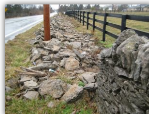
Old Richmond Road Fence

Volunteer Work Days help preserve Kentucky's rock fences by pairing damaged fences with a team of volunteers who have taken at least one Conservancy workshop. Volunteers are needed to continue this important program, as work begun this spring is not completed.