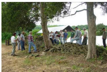
Introductory Fence Workshop, before