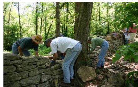
Volunteer Work Day in Central Kentucky

Dry Stone Conservancy 1065 Dove Run Road, Suite 6 Lexington, KY 40502 Phone: (859)266-4807 Fax: (859)266-4840